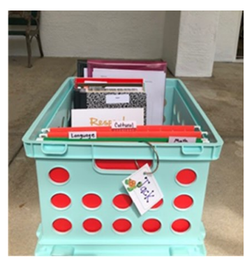
(Caption: Above you'll see Gardenia Room's virtual supply bins for family pick-up before the first day)

This whole new experience has brought us together to adapt in ways we could never have imagined. Ms. Bubli has been the source for many thoughtful projects at the school to make staff, teachers, and students comfortable. This includes projects like adding a multitude of canopies to the outdoor playground area for outdoor learning options, a paved outdoor patio outside of Poinciana and Cedar classrooms and buying portable headphones with speaking devices for teachers.